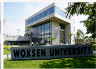
WOXSEN INTERNATIONAL UNIVERSITY